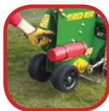
Single handed height adjustment