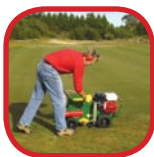
Honda engine for easy starts