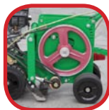
Simple & reliable belt drive system